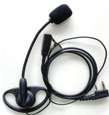
Boom Mic Handsfree