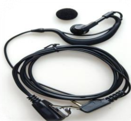
C Type Handsfree