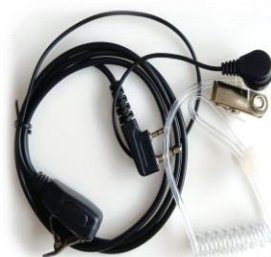
Clear Tube Handsfree