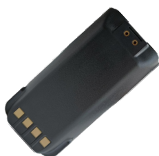
4500mAh LITHIUM BATTERY