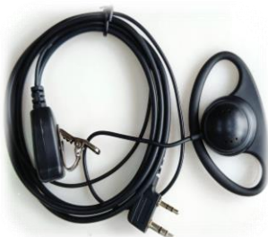
D Type Handsfree