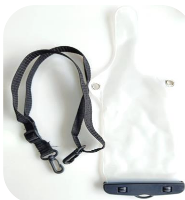
Water Proof Cover